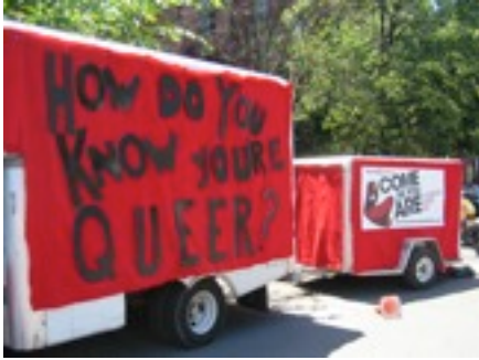
Boston Pride Float '09