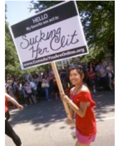
Our signs included: Getting Tied Up, Teabagging, 69, Double penetration, Topping my Boyfriend with a Strap-on...

"I LOVE The Theatre Offensive. They captured what Pride USED to be: bold, daring, irreverent, ALIVE. As they passed gayly forward, I thought, 'God, I miss THIS face of the gay community!'" -Moment to Moment Blog