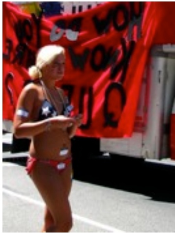
A marcher loves her stickers!

"I LOVE The Theatre Offensive. They captured what Pride USED to be: bold, daring, irreverent, ALIVE. As they passed gayly forward, I thought, 'God, I miss THIS face of the gay community!'" -Moment to Moment Blog