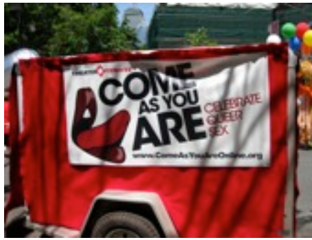
Close up of the Come As You Are! Banner