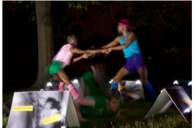
A Street Theater Named Desire performing at a Boston cruising area at 2am on a Saturday