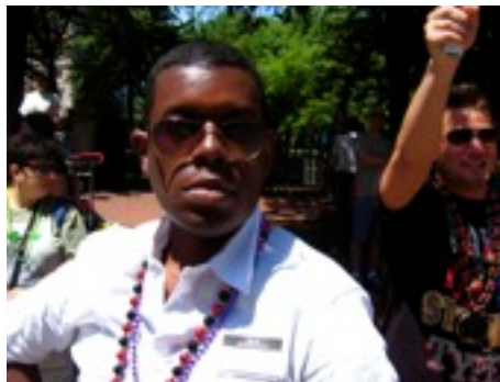
Too cool for a sticker...