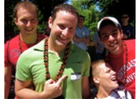
Hello! My Favorite Sex Act is: "Against the Wall"