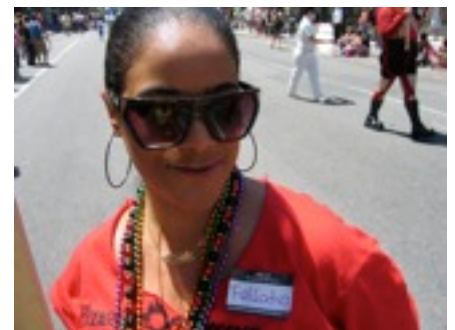
The float amassed spontaneous volunteers en route